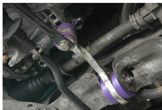
Figure 3 - Fitted